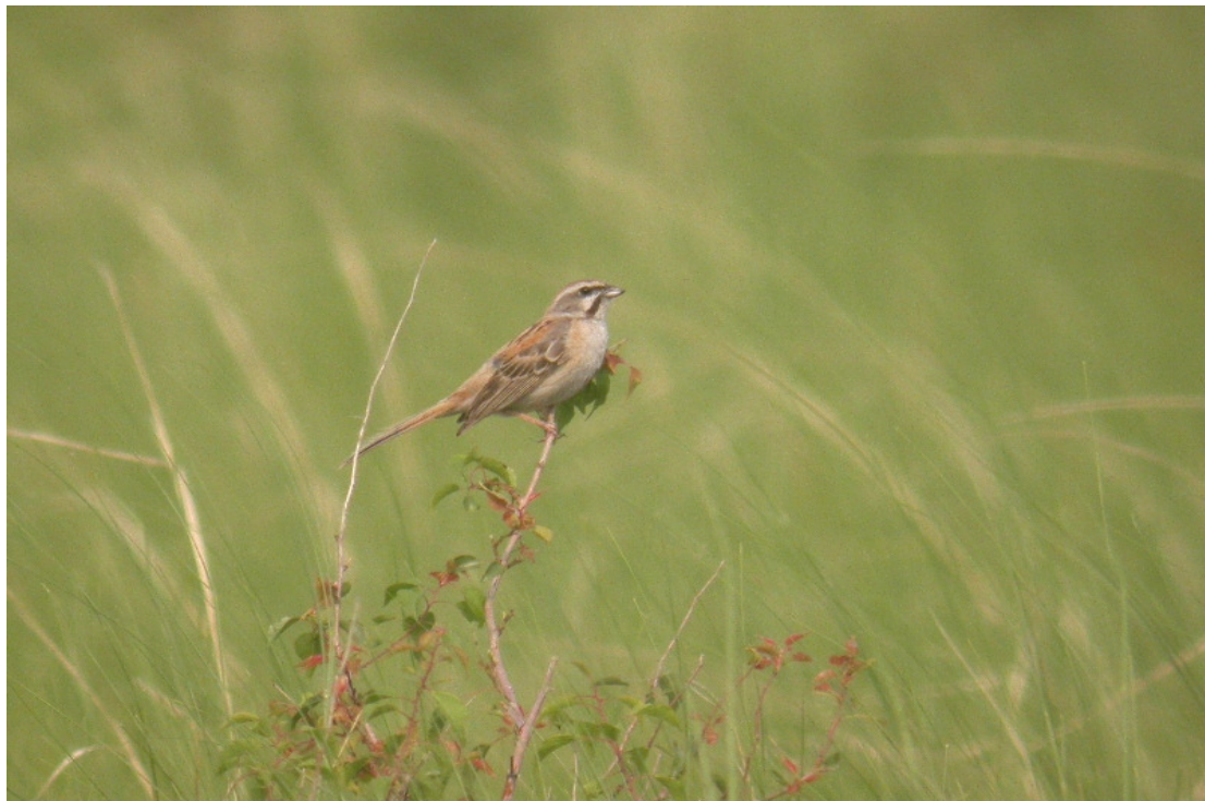
Rufous-backed Bunting Emberiza jankowskii in the grasslands at Beidagang (CN038); recent changes in this habitat type might account for the sharp decline in the numbers of this globally vulnerable species.

IBAs are represented on the map as circles proportional to their areas. Key: ● = Protected; ◐ = Partially protected; ○ = Unprotected.