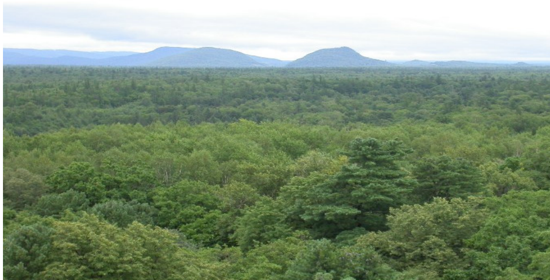
Changbai Shan (CN048) was one of the earliest nature reserves to be established in mainland China, to preserve the typical forest landscape of north-eastern China.

IMPORTANCE TO OTHER FAUNA AND FLORA: No information.