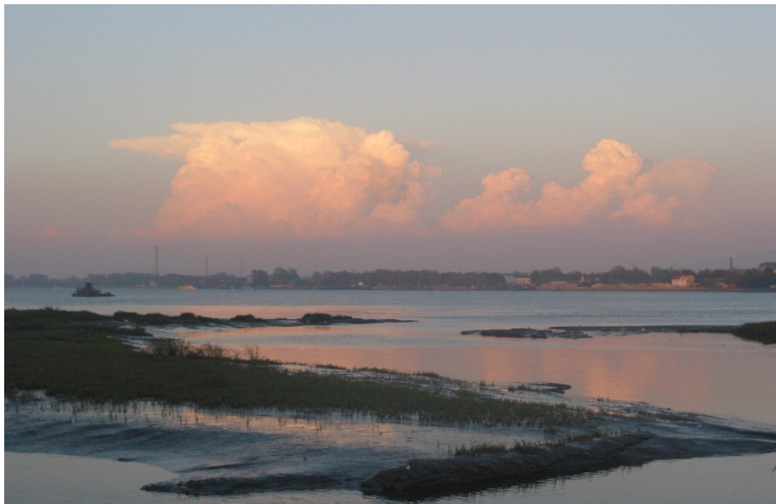
Hundreds of thousands of shorebirds and other waterbirds migrate through the Yalü Jiang Estuary (CN062), a wetland on the border of mainland China and North Korea.

Key: ● = Protected; ◐ = Partially protected; ○ = Unprotected.