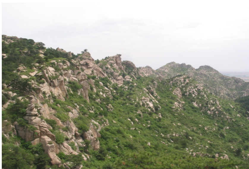
Yiwulü Shan (CN051) means 'green mountain' in the Manchu language, and the IBA is a national nature reserve and a famous scenic area in Liaoning.

IMPORTANCE TO OTHER FAUNA AND FLORA: Mammal populations have declined in recent years, and now there are only occasional records of smaller species such as hares, badgers, Siberian Weasel and Raccoon Dogs.