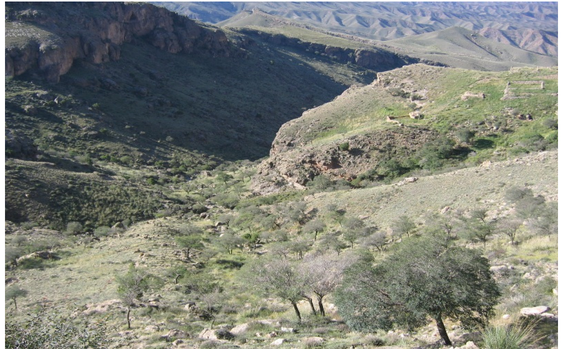
Nei Mongol Helan Shan Nature Reserve (CN089) is located in the highest mountain range in Inner Mongolia, which straddles the border with Ningxia Autonomous Region where another nature reserve has been established (CN174).

IBAs are represented on the map as circles proportional to their areas. Key: \bullet = Protected; \bigcirc = Partially protected; \bigcirc = Unprotected.