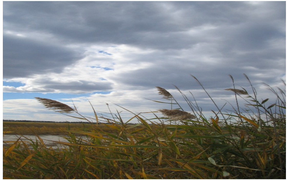
Tumuji Nature Reserve (CN073) is one of the most important breeding grounds of Great Bustard Otis tarda in mainland China, and in the late 1990s the Northeast Forestry University and BirdLife Asia worked together to study and conserve the species there.

IBA CODE: CN074 NAME: Holqin Nature Reserve CRITERIA: A1 A4i AREA: 126,987 ha COORDINATES: 44°54'N 121°57'E ALTITUDE: 180-200 m CONSERVATION STATUS: Established as Holqin National Nature Reserve in 1995. GENERAL DESCRIPTION: Located in Holqin Youyi Zhongqi (a district unit similar to a 'village'). The IBA includes the flood plain near the southern slopes of the Da Hinggan Ling mountains, with large areas of marshland. The natural vegetation is well preserved in this area. THREATENED SPECIES: Grus leucogeranus (CR), Ciconia boyciana (EN), Grus japonensis (EN), Aquila clanga (VU), Grus vipio (VU), Grus monacha (VU), Otis tarda (VU) CONGREGATORY WATERBIRDS: Grus japonensis IMPORTANCE TO OTHER FAUNA AND FLORA: Procapra gutturosa occurs in this area.