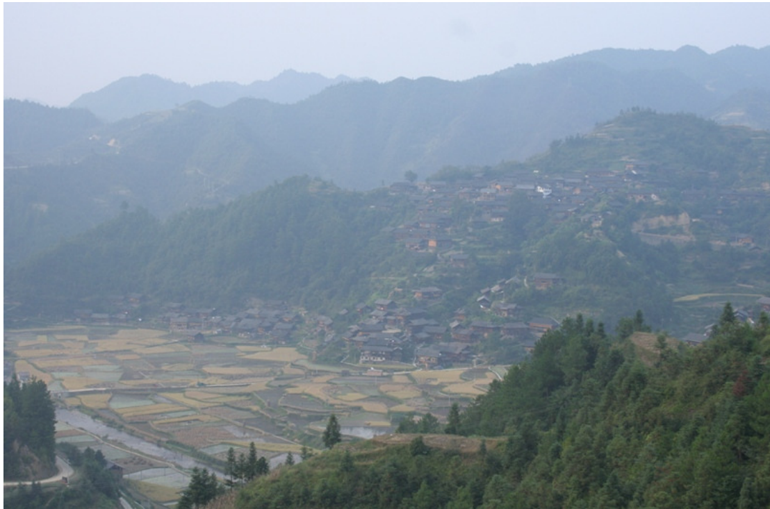
Leigong Shan (CN288), one of the many forests in the mountains of Guizhou which support the characteristic bird species of south-western China.

Key: ● = Protected; ○ = Partially protected; ○ = Unprotected.