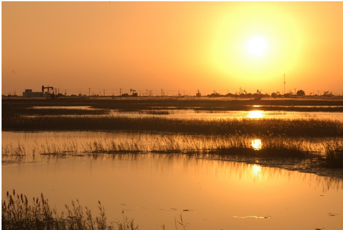
The Yellow River Delta (CN327) includes relatively new areas of land that have been created where the river water discharges into the sea, and it supports millions of birds that winter or pass through on migration.

Key: ● = Protected; ◐ = Partially protected; ○ = Unprotected.