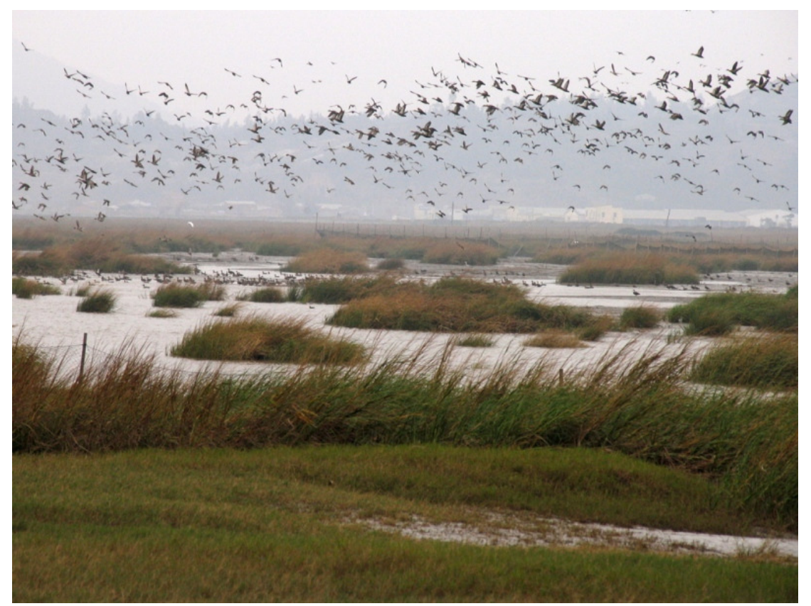
The Min Jiang Estuary (CN411), which is in the suburbs of Fuzhou city, is a wintering and stop-over site for several globally threatened bird species.

IMPORTANCE TO OTHER FAUNA AND FLORA: No information.