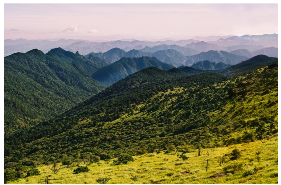
Wuyi Shan (CN408), which is located on the border between Fujian and Jiangxi provinces, was one of the first sites where ornithological research was conducted in mainland China.